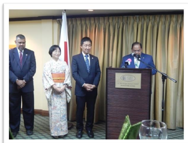
Remarks by Prime Minister Nagamootoo